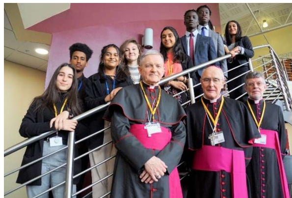
Photo of Papal Nuncio with Sixth Form students in the Atrium